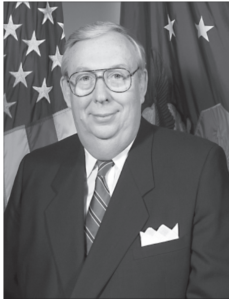
James Roche Secretary of the Air Force

"Over the past decade, our nation has de-