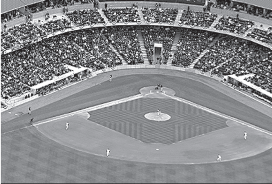
A record crowd of more than 1,250 KyANG family members is expected at tonight's RiverBats game against the Durham Bulls. Gates open at 5 p.m.